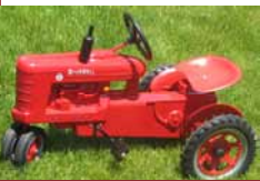
Brand New Farmall Super H tractor

Delicious homemade foods and baked goods Friday and Saturday