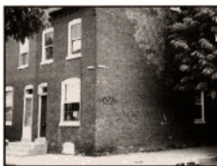
545 E. Strawberry St. Lancaster

serves as the hub for the various programs focusing on the Strawberry Street neighborhood as well as providing a central meeting place for ministry planning and board meetings. The house has provided the opportunity to have an annual Christmas caroling event in the neighborhood, as well as a summer chicken